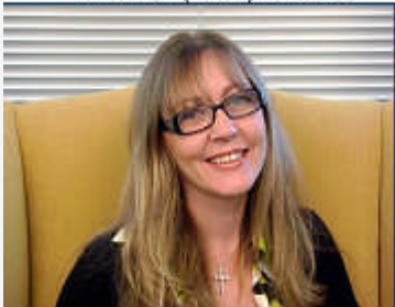
Account Executive/Dept Supervisor